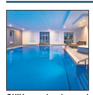
CHILL... swimming pool CAMBRIDGE BELFRY Cambourne

additional charges. For more information, see travelsupermarket.com.